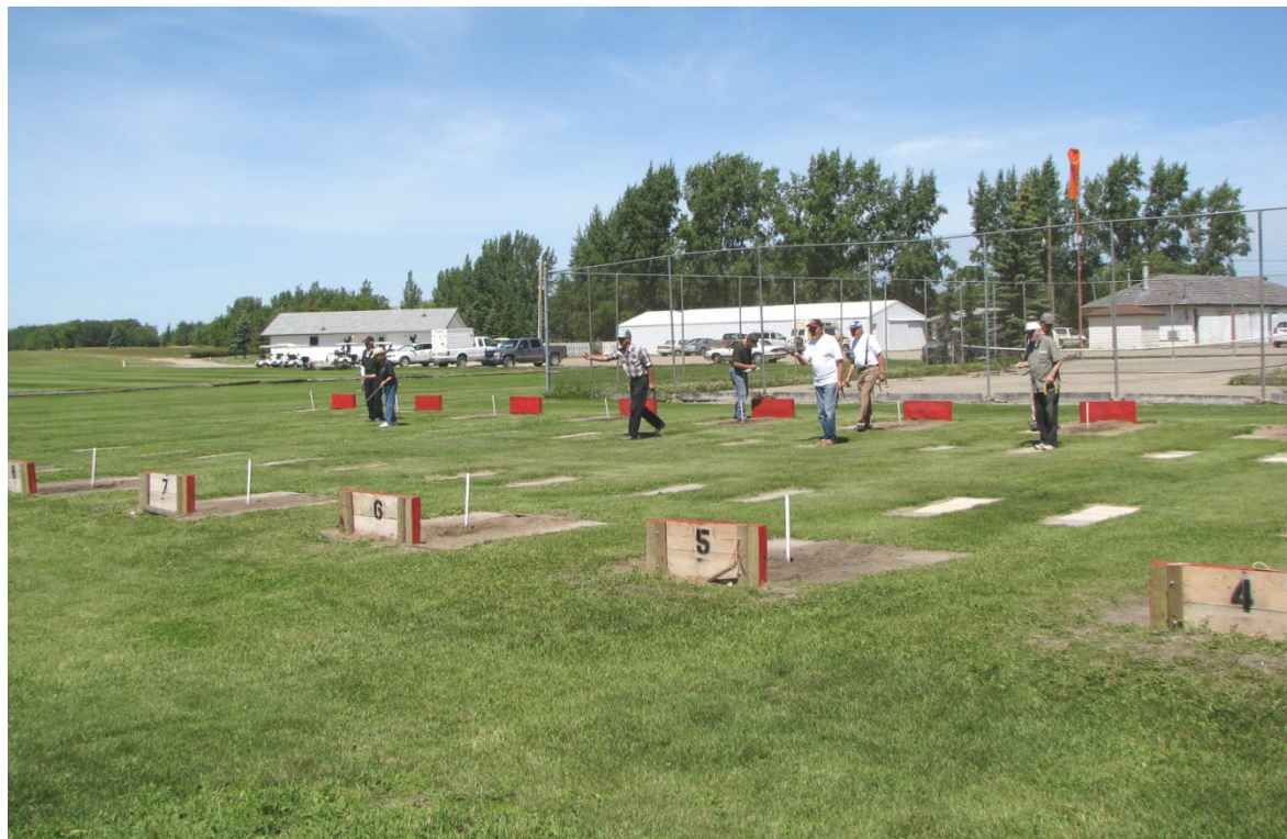
The Whitewood Courts