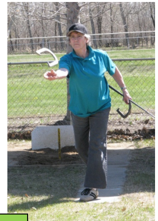
Pitchers at the 2009 Spring Fling